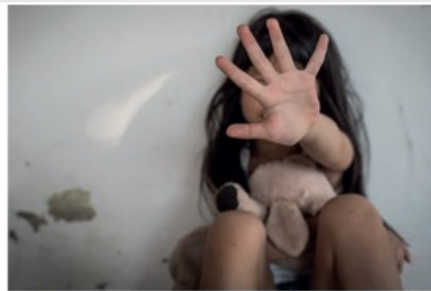
„Stop abusing violence. violence, terrified, A fearful child“

2.3 Perpetrator and victim before/during the crime