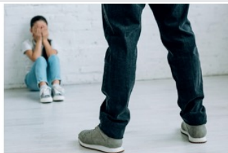
„cropped view of father holding belt and scared daughter sitting on floor“