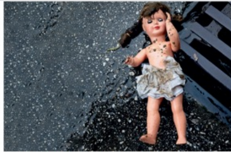
„Misshandlung und Missbrauch von Kindern“