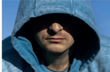
„Man in blue hoodie. Close up portrait of a man in a hood on the sky background. An unrecognizable face is hidden in the shadow.“