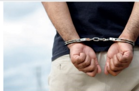
„Arrest the offender. Prison male criminal standing in handcuffs with hands behind back.“

Note. a Reliability for this variable could not be calculated, because the image motif was not present in the pretest sample.