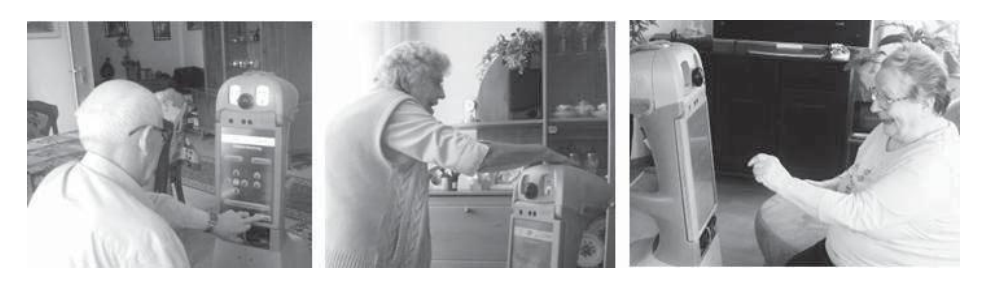
Figure 2. Users interacting with the Robot.

Despite the fact that all three users showed some concern regarding safety and usability, the overall user experience was positive: Respondents (see figure 2) were satisfied, joy of use was rated high.