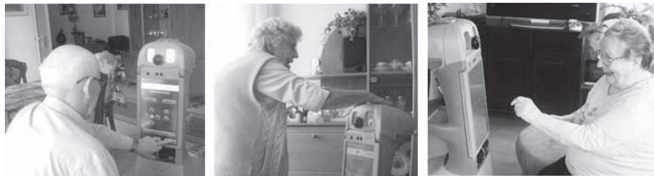
Figure 2. Users interacting with the Robot.

Despite the fact that all three users showed some concern regarding safety and usability, the overall user experience was positive: Respondents (see figure 2) were satisfied, joy of use was rated high.